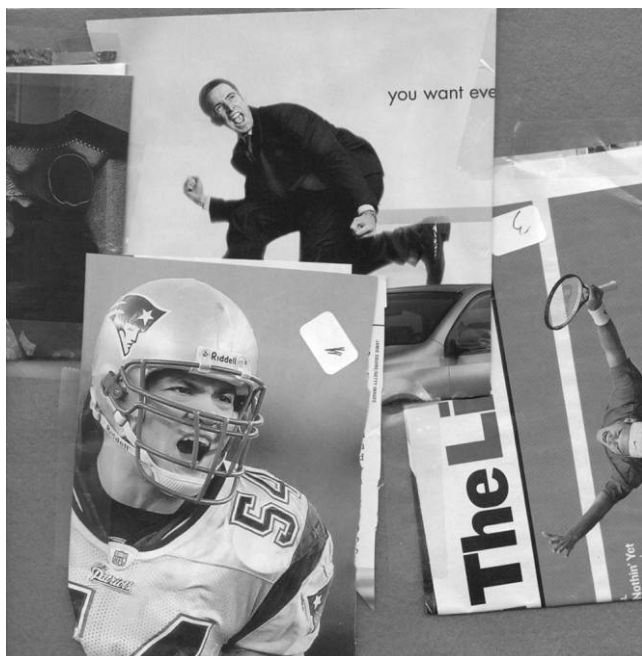
FIGURE 2 TIM'S SUMMARY IMAGE

This intense and ongoing cycle is what helps casino gamblers reignite their desire. In contrast, our data suggest that online gamblers do not go through the same level of emotional preparation as they get themselves ready to play online. That is, they do not ignite a major “fire of desire” like the casino participants do. We believe that this difference contributes to a muted reaction to the outcomes of online gambling. Indeed, rather than discussing online gambling in highly charged emotional language, online participants describe it in rather mundane ways, likening the feeling to other passive behaviors, as Jessica does: